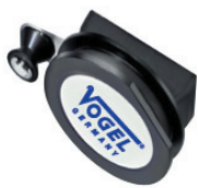
ART No 270160/1