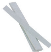
ART No 270160/8