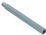
ART No 270160/2