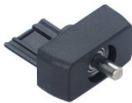
ART No 270160/3