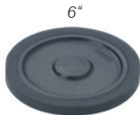
ART No 270160/7